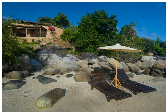
Mudra Villa, Koh Samui, Thailand