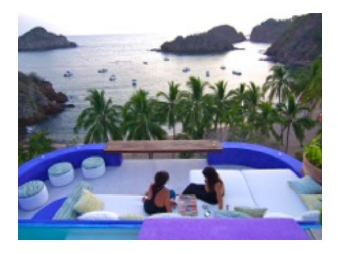
Casita Al Mar, Careyes, Mexico