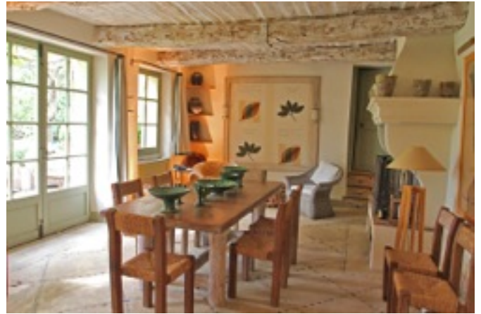
Maison de Lavande, Lourmarin, France